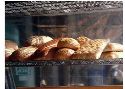
"Bread" Photographer's Choice Paige Shoemaker "the fresh bread that speaks of the Strip and its products and that reflex in the plastic...well seen and snapped."